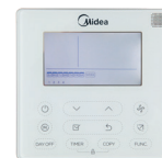
Wired Controller KJR-120X+MFCB