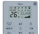
Wired Controller KJR29B